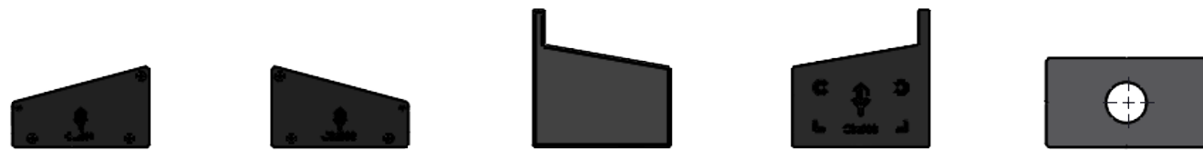
CS2001 - Black LH Handrail End cap CS2002 - Black RH Handrail End cap CS2007 - Black LH Base Track End cap CS2008 - Black RH Base Track End cap CS3001 - WPa Aluminium Washer Plate